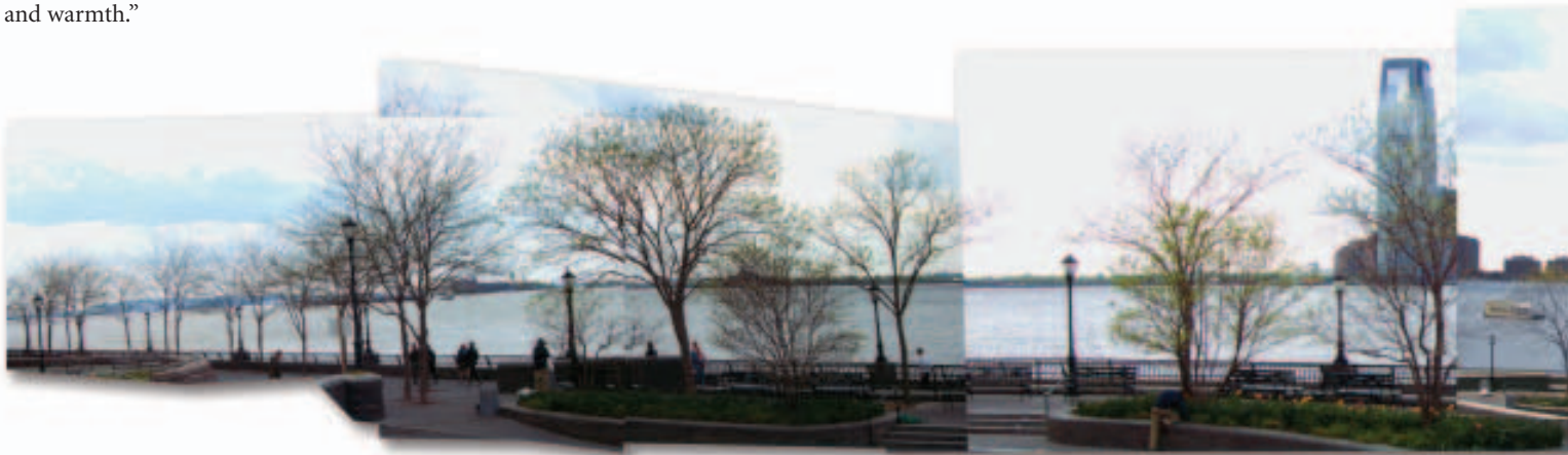
ON A CLEAR DAY | The new Poets House will face Battery Park City’s beautiful gardens, providing a stunning view of the Hudson River. (Composite image by Louise Braverman, Architect.)